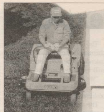
Dixon ZTR 542 mower