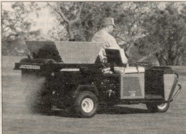
Top dresser attachments show versatility for some utility vehicles, like this 2315 Diesel Truck made by Jacobsen.

"What we've done, for instance, is to make a design that will specifically handle three different jobs—spreader, sprayer and utility hauler—and made sure that the traction unit can accommodate all of these uses. You don't do everything at once on a golf course, so you can get one traction unit, and the three separate