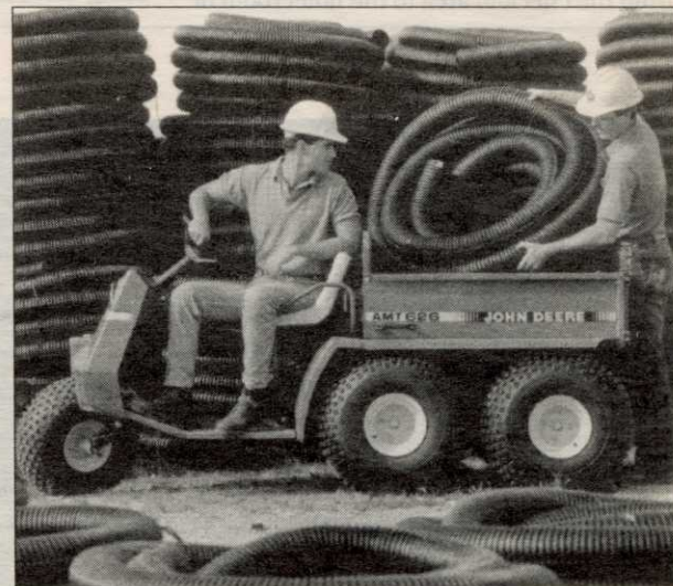
John Deere's 10-horsepower, two-passenger AMT626 runs with a wide stance for stability and versatility.

"I'm not saying that there isn't room in the middle of these two types of equipment, but there does seem to be a polarization in the industry."