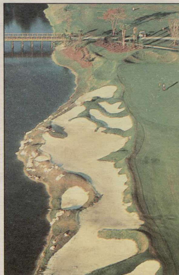
Emerald Dunes: Voted best new public course.