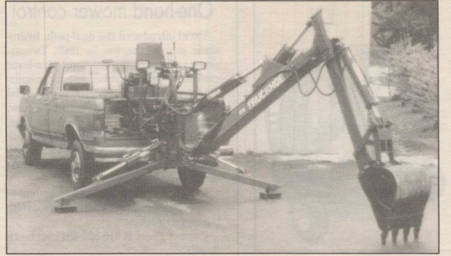
The Truckhoe from Darby Industries.