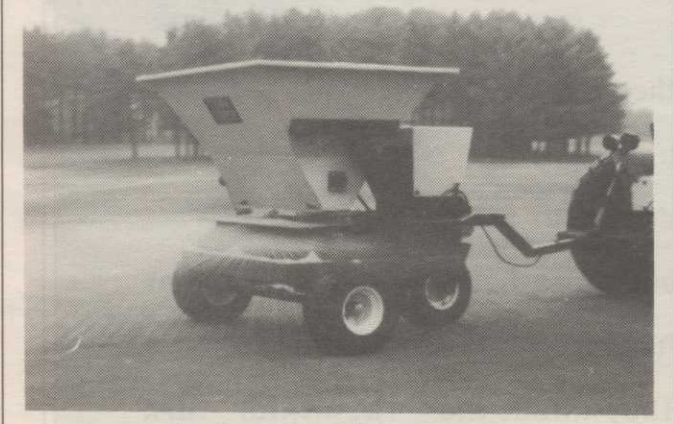
Look At These Advantages

•FAST: Does not lay the topdressing on top of the