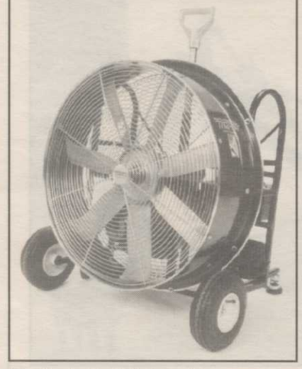
The Tempest portable power blower