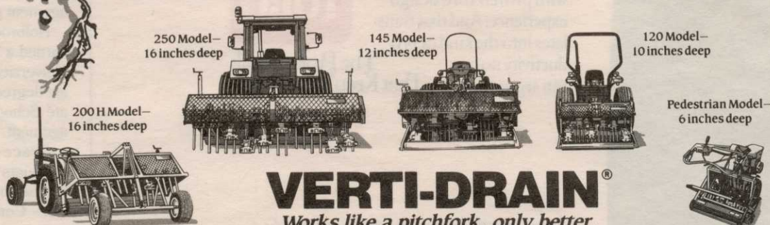
250 Model—16 inches deep

No matter what your aeration productivity and depth requirements are, Verti-Drain has a model and the attachments to meet your needs. Call or write today for more details and the name of a dealer near you.