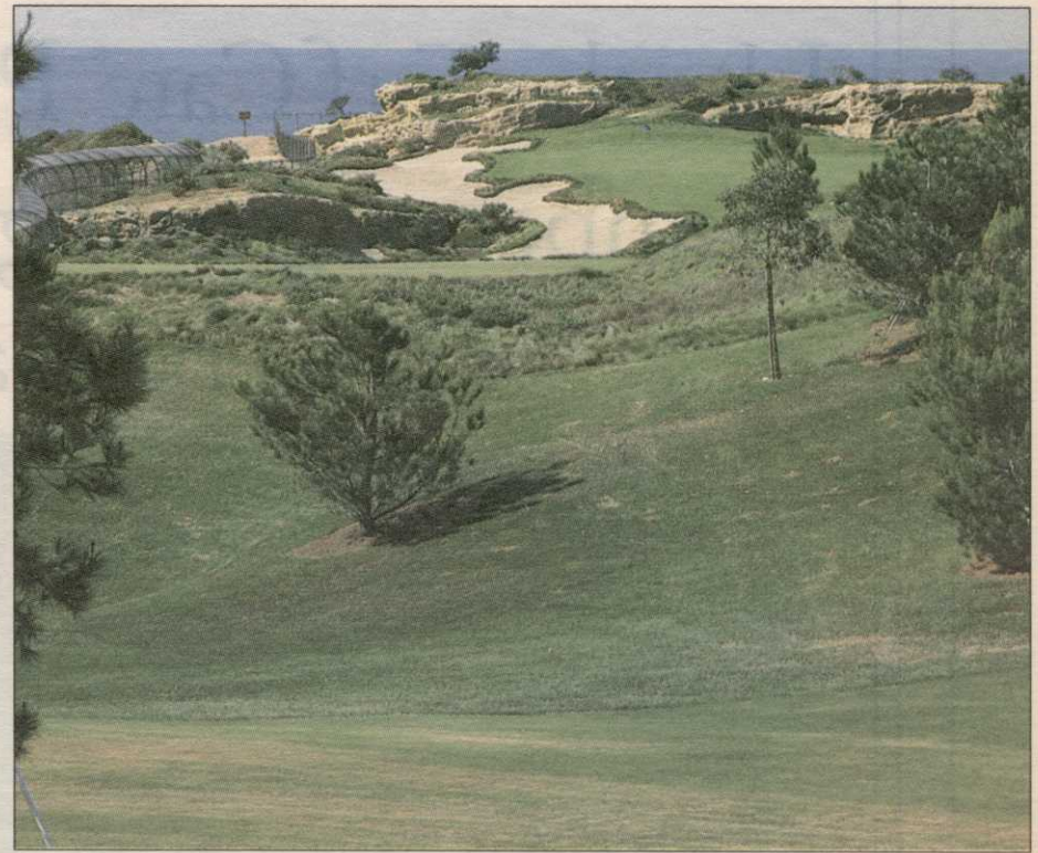
Pelican Hill Ocean Course's 12th hole, a 212-yard par-3 called Pelican's Nest, features a large green nestled among rock outcroppings, with a large waste area in front of the green. The course was designed by Tom Fazio.

Fazio's supporters attributed their votes