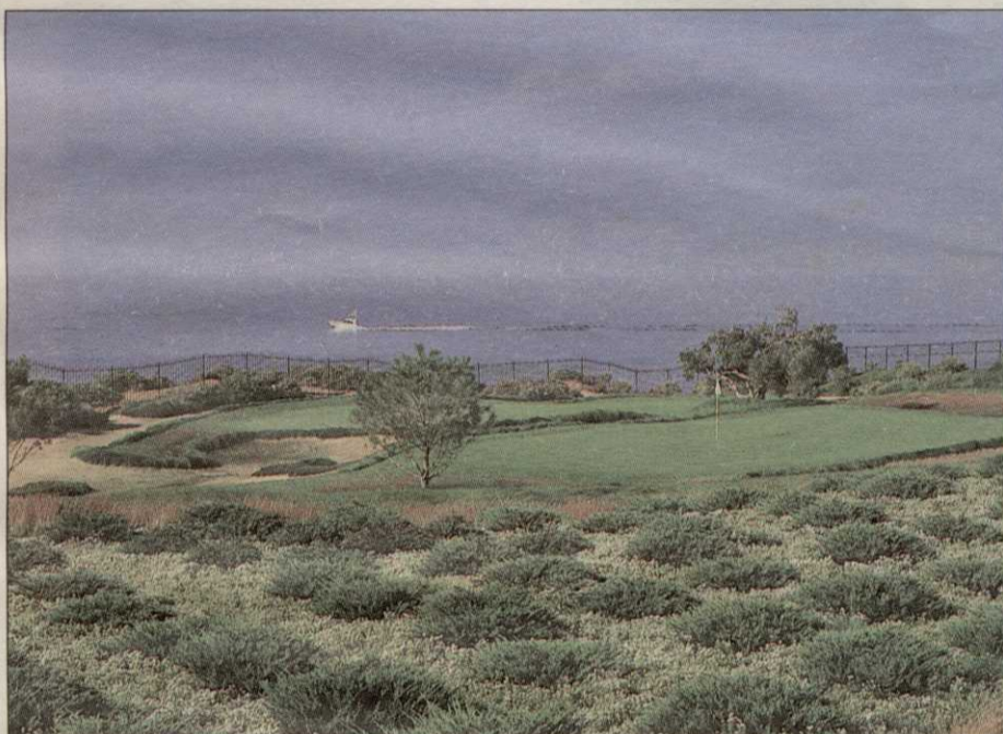
One of the most talked-about holes at architect Tom Fazio's Ocean Course at Pelican Hill Golf Club in Newport Beach, Calif., is the 13th. It features two small greens fronted by a large area of coastal scrub and sand. The Ocean Course opened in November. A second 18-hole venue at Pelican Hill — the Canyon Course — is slated for completion some time later. The project was developed by The Irvine Co. For more on Pelican Hill and other new golf courses, see pages 27-43.