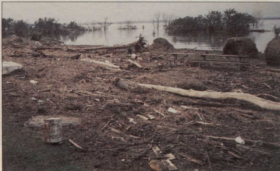
Retreating flood waters left behind massive debris throughout Ridgewood Country Club in Waco, Texas, including the 10th fairway.