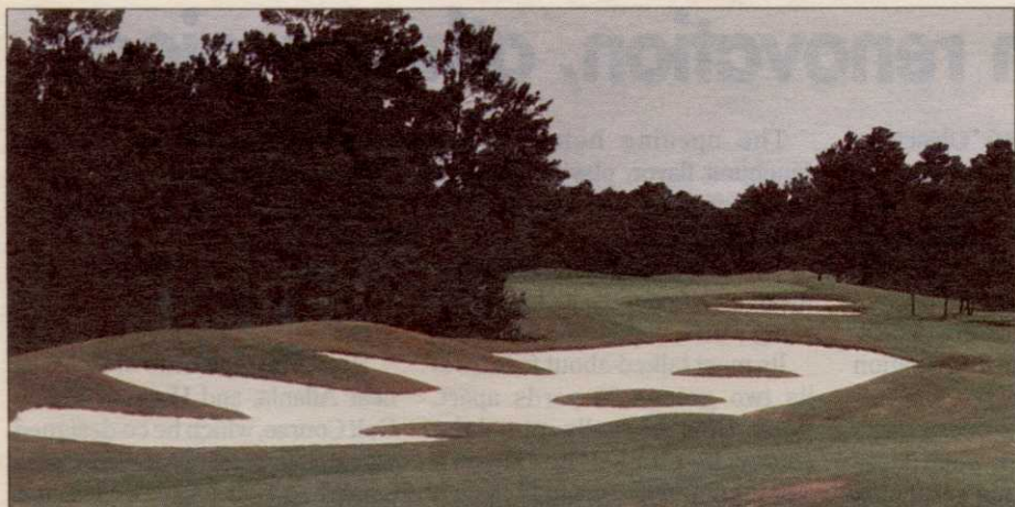
The par 4, 419-yard 15th hole at The Habitat near Valkaria Airport displays some of the beauty of Charles Ankrom's design on an environmentally sensitive site.