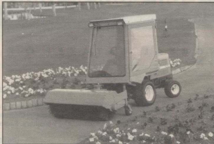
The F1098 soft-side sweeper from Kubota