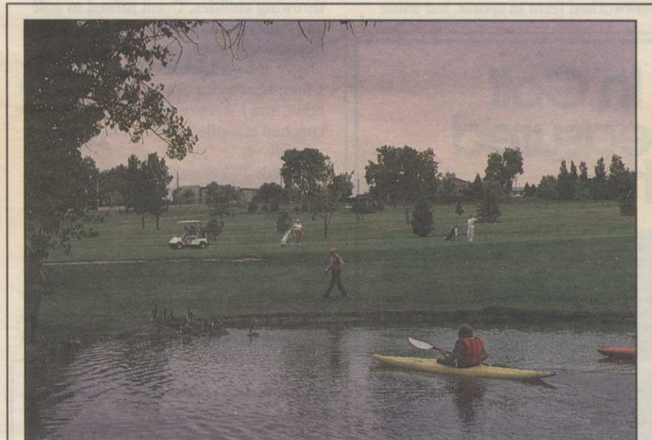
A kayaker herds a flock of geese out of a pond at Indian Tree Golf Course in Lakewood, Colo., for transportation out of state.