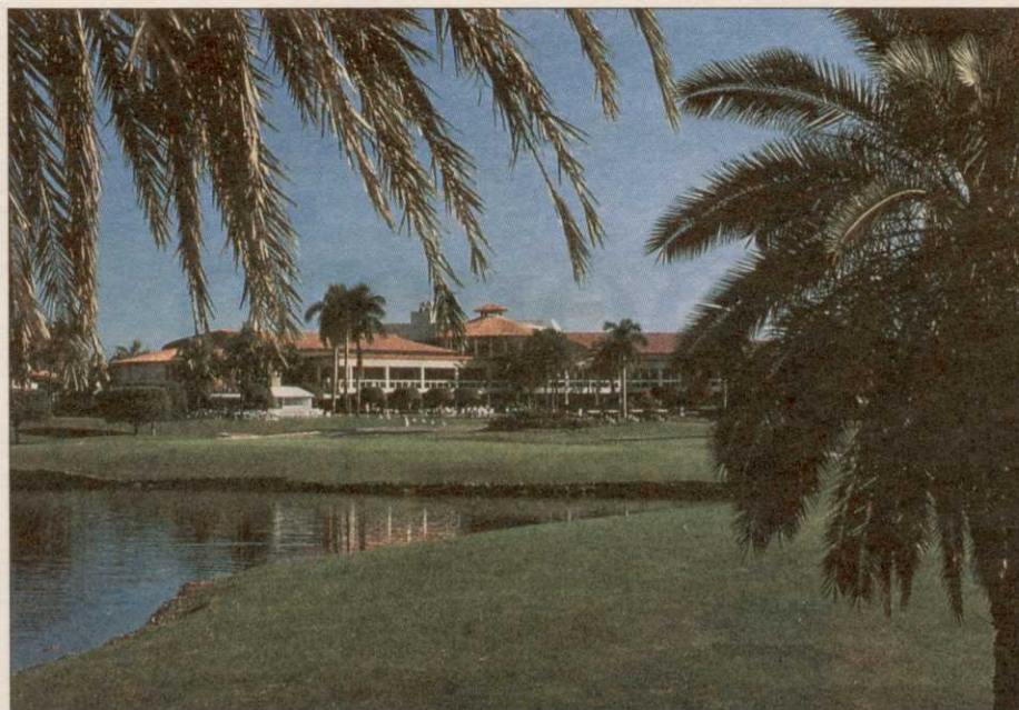
The 18th at Doral's Green Monster course (above) garnered the respect of PGA Tour players, as did the finishing hole at Augusta National (below).