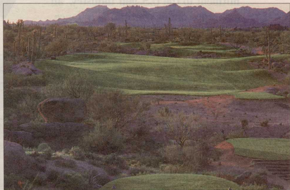
The 4th hole of The Boulders' new nine features an elevated tee overlooking the fourth fairway with a vista all the way to Pinnacle Peak. The par-4, 409-yard hole has a natural wash to the left that is home to quail, mule deer and a family of bobcats. Saguaro cacti line the fairway and a two-level green is tucked away behind a rock formation.