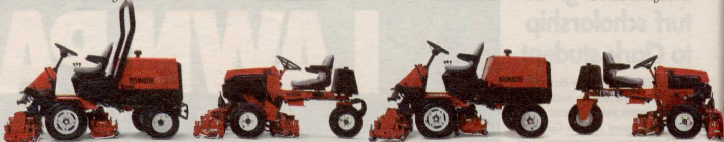
REELMASTER 335-D 4 wheel drive, diesel powered 5 blade fixed head.