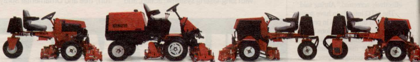
REELMASTER 216 2 wheel drive, gasoline powered 5 blade floating head.