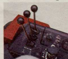
The 335 offers independent reel control levers and variable reel speed control knob.