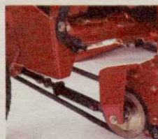
The 216 offers a unique reel drive system that maintains constant belt tension.