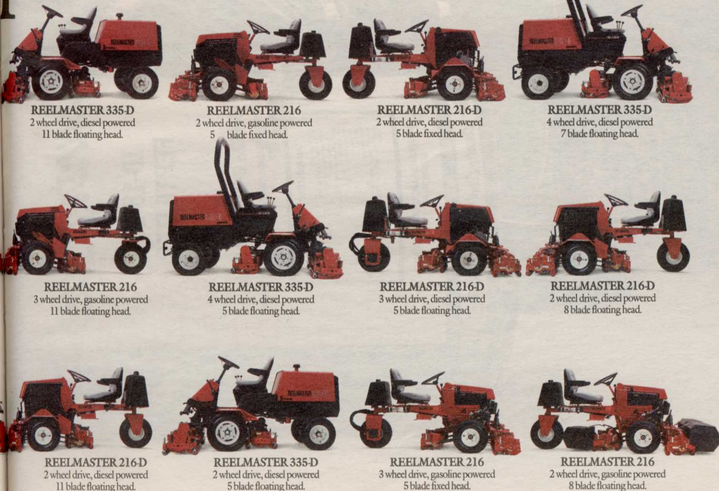
REELMASTER 335-D 2 wheel drive, diesel powered 11 blade floating head.