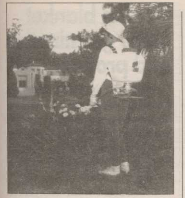
EstateKeeper backpack sprayer