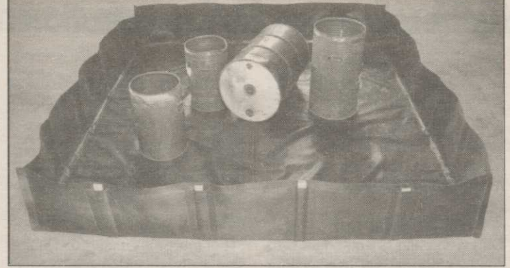
ThermaFab portable hazardous waste storage system

10,000 gallons and is the ideal containment system to collect liquid from leaking drums, as well as overflow spills from tank trucks.