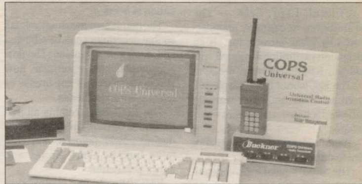
COPS Universal and Model 20321

For more information on COPS Universal or any other Buckner