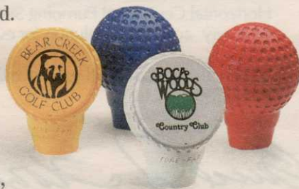
Fore-Par's Classic golf ball on a tee marker in regular and personalized models.

So equip your golf course with the finest accessories available. Call for your free Fore-Par catalog today!