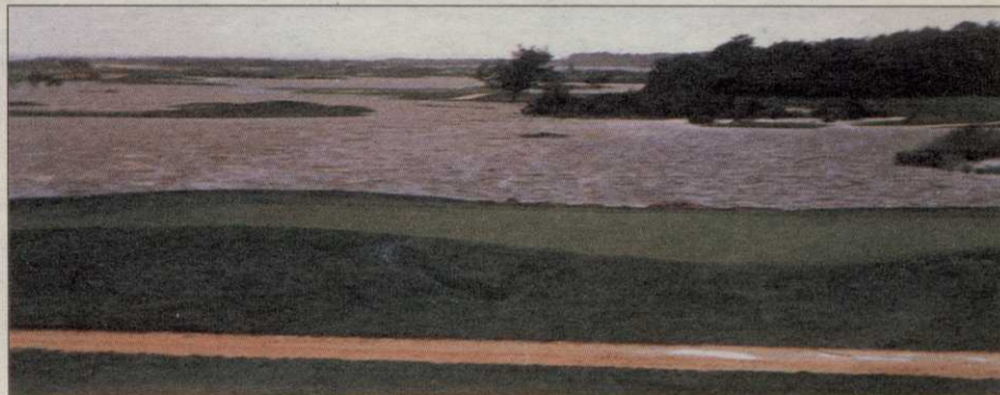
The ocean flooded in on New Seabury golf course, inundating the front nine holes.

Cleanup chores, turf treatment, reseeding, replantings and repainting kept groundskeeping and clubhouse crews busy into September.