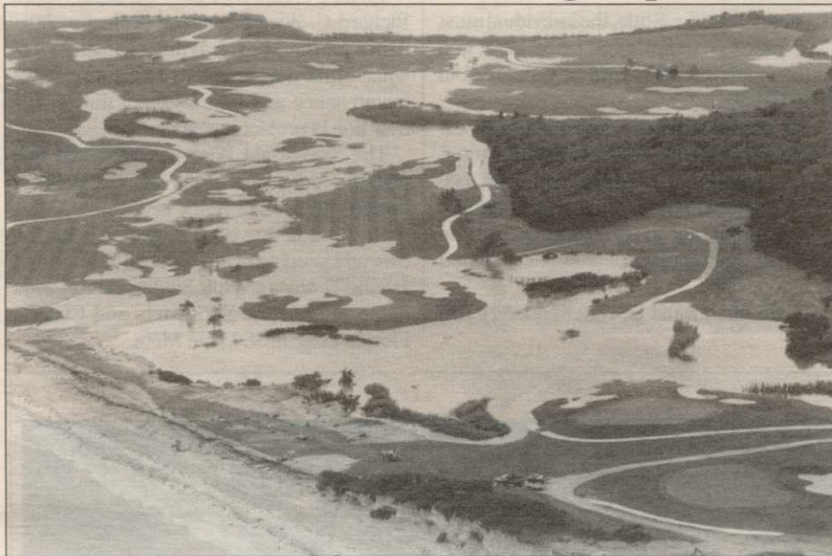
The front nine holes of New Seabury's Blue Course is flooded with water following Hurricane Bob, which passed over Cape Cod on Aug. 19.

Colombo said that before the storm: "I realized it (front nine) was vulnerable. Everyone always wondered what would happen if a really big storm hit. Now they know."