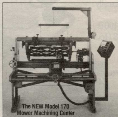
The NEW Model 170 Mower Machining Center

All Neary Models sharpen faster, more accurately than ever, thanks to our continued engineering innovations. Find out which upgradeable Model meets both your performance and your budget needs. Call today for FREE literature or the name of the Neary dealer nearest you. 800-233-4973