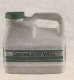
Always follow label directions carefully when using turf chemicals.