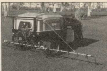
Cushman Turf Master

The spray unit is available with either 15-foot or 20-foot spray booms, supplied by a 160-gallon molded fiberglass tank. The vehicle