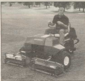
Jacobsen Tri-King 1671G triplex mower pattern to 42,750 square feet per hour with a 5-by-2-inch pattern.

The pattern adjusts from 1-by-2 inches to 5-by-2 inches. With a 48-inch aeration swath, the PT2448 can cover from 8,550 square feet per hour with a 1-by-2-inch hole