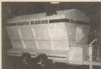
Model 2200 Dakota Blender