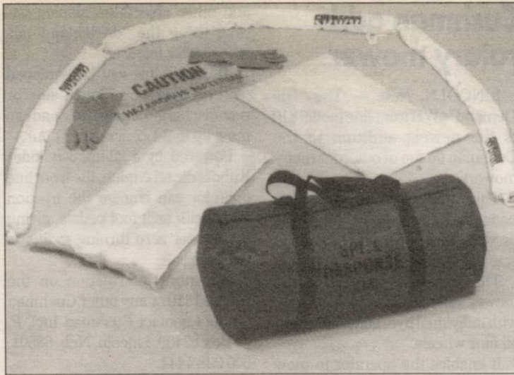
Precision Labs spill response kit