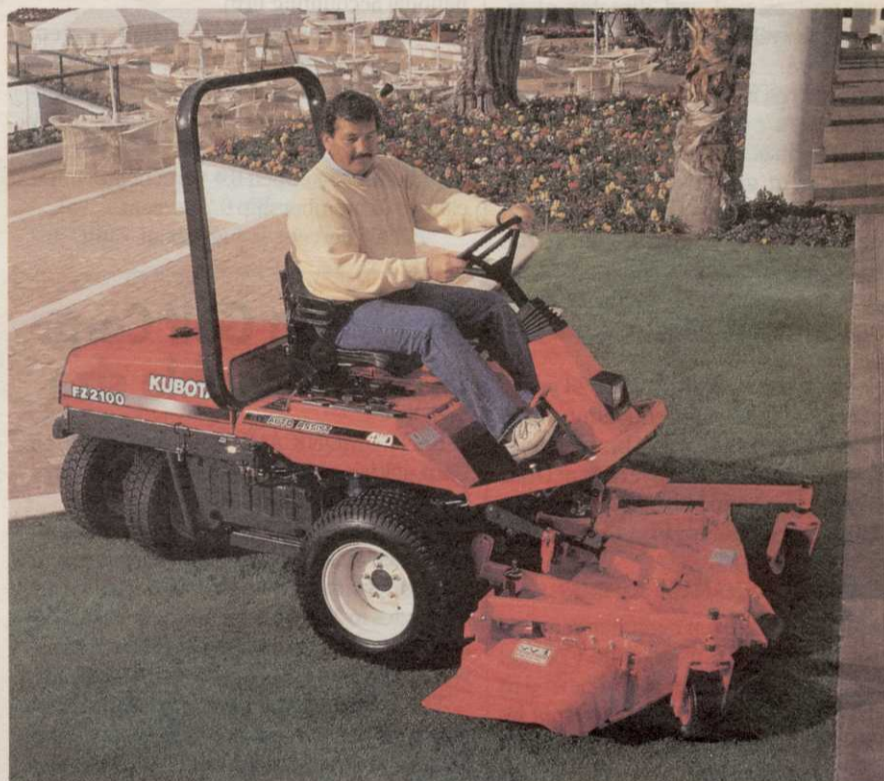
Kubota's FZ2100 with Auto Assist Differential and Zero Diameter Turning Radius.

Kubota has introduced a complete new mowing system, the FZ2100 Front Mower. From "A" — Auto Assist Differential (AAD) to "Z" — Zero Diameter Turning Radius (ZDT), it increases your power and mobility to handle all your mowing needs.