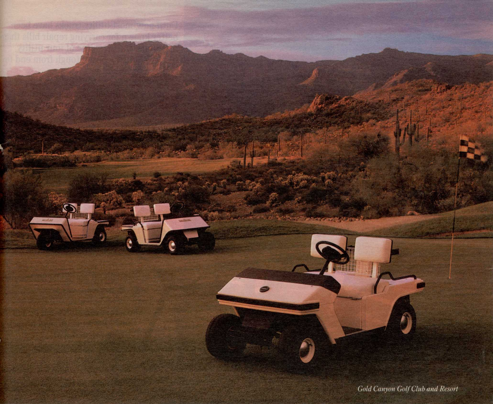
Gold Canyon Golf Club and Resort