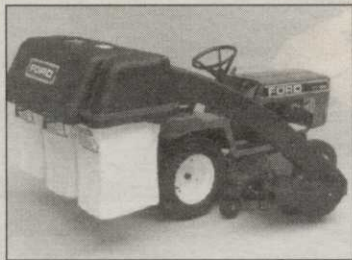
Ford 3-bag grass collectors

The blower impeller for commercial mowers is driven from the right-hand mower spindle.