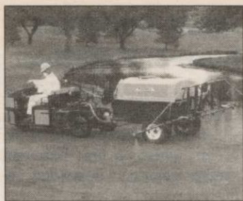
Cushman 240-gallon sprayer

The new sprayer offers golf course superintendents increased capacity for all turf spraying applications, along with excellent maneuverability and a ground pressure of just 11 psi to keep compaction to a minimum.