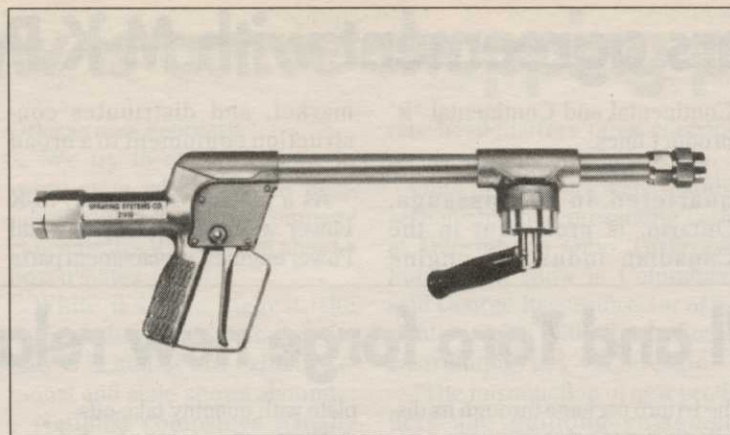
GunJet Tree Spray Gun

ling action at the hose connection to eliminate twisting and knotting