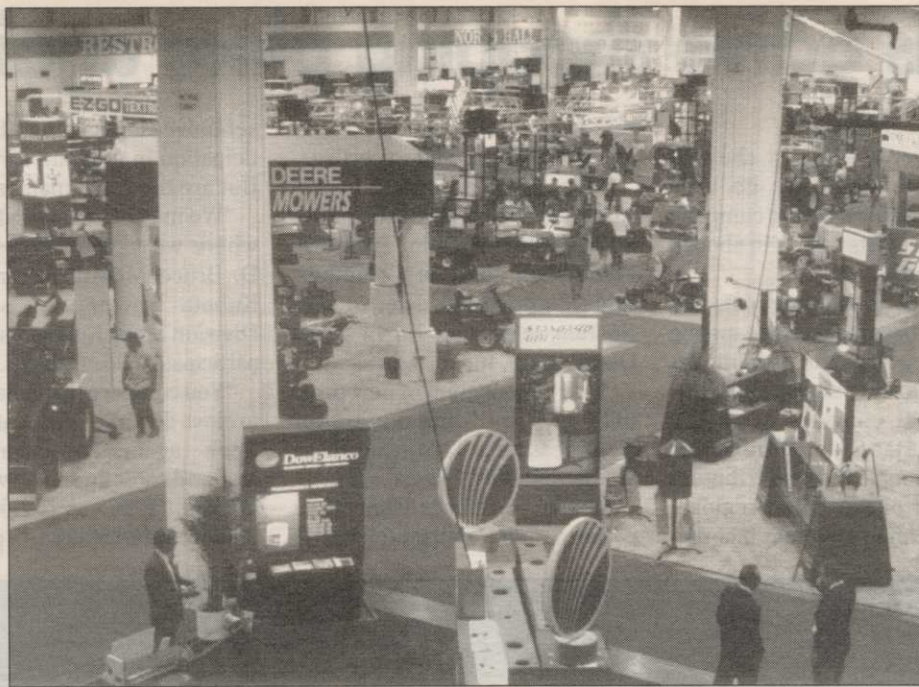
GCSAA Annual Trade Show in Las Vegas

Aquatrols manufactures and markets worldwide AquaGro soil wetting agents and the transpiration minimizer, FoliCote.