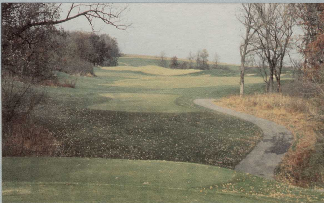
The University of Wisconsin has joined the growing ranks of universities with affiliated golf courses. This is a view of its new Robert Trent Jones Jr.-designed course, which officially opens in July. See a story on university courses on page 33.