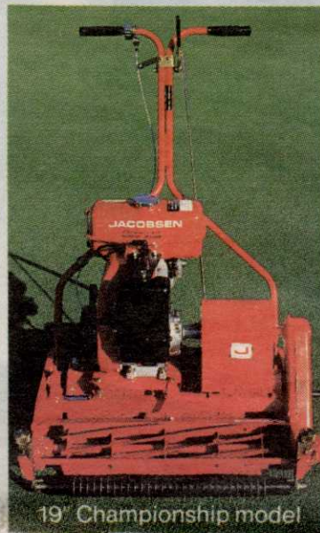
19" Championship model

Ask your Jacobsen distributor for a free demonstration. Attractive lease and finance plans available. Or contact: Jacobsen Division of Textron Inc., Racine, WI 53403.