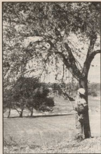
Technic Tool Power Pruner