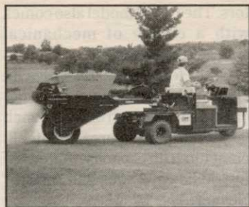
Cushman 5th Wheel Top Dresser

Cushman ground speed governor control on the Turf Truckster.