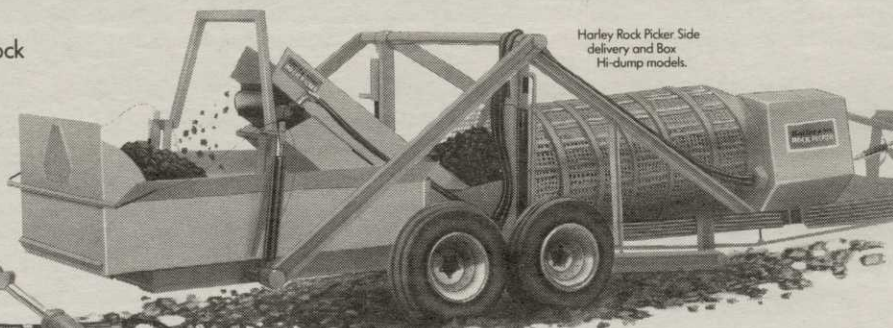
Harley Rock Picker Side delivery and Box Hi-dump models.

Our Harley Rock Rakes and Rock Pickers are built to work day-in-day-out, dawn-to-dusk, year-after-year. Fact is, a number of Harleys have been in steady use for