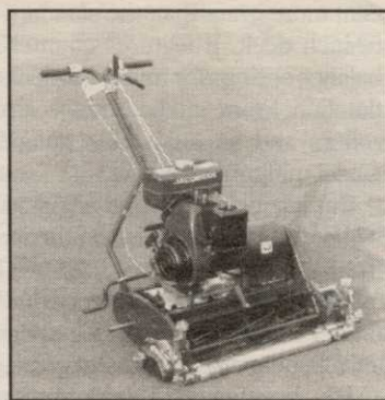
Jacobsen greens mower

Other refinements include an improved throttle handle and cable, an improved clutch that needs fewer adjustments, and a new differential that provides