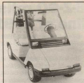
Yamaha G5 Sun Classic golf car