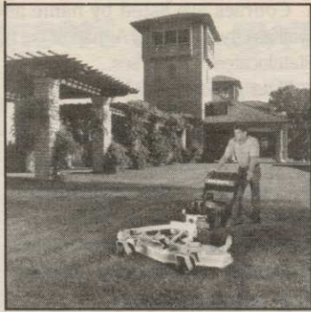
John Deere walk-behind mower

All four models feature infinite cutting height adjustment between one and four inches. Fuel capacity is five gallons. Ground speed can be adjusted to five different settings between 1.6 and 5.9 mph.