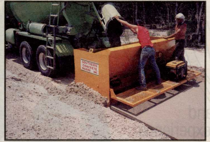
Patented and manufactured by Southern Concrete Pavers. US Patent #4878778

Thinking about redoing or installing a cart path system on your course? Whatever your cart path needs are, we can do it.