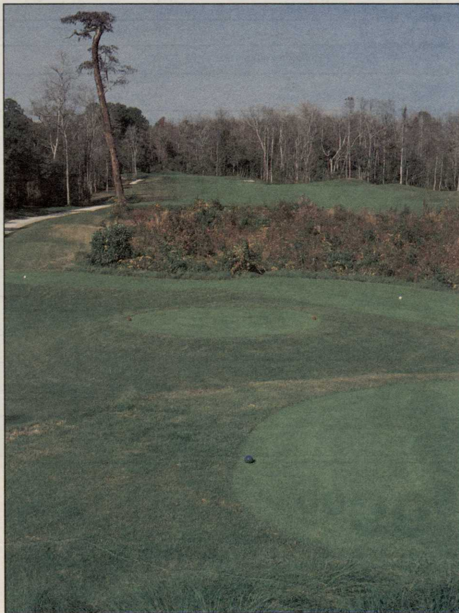
The par 4, 331-yard 4th hole at Cypress Knoll Golf Course in Palm Coast, Fla., is vintage Gary Player design. The tee shot is critical, carrying a wild-growth area. The second shot is a short iron to a green guarded by three pot bunkers.