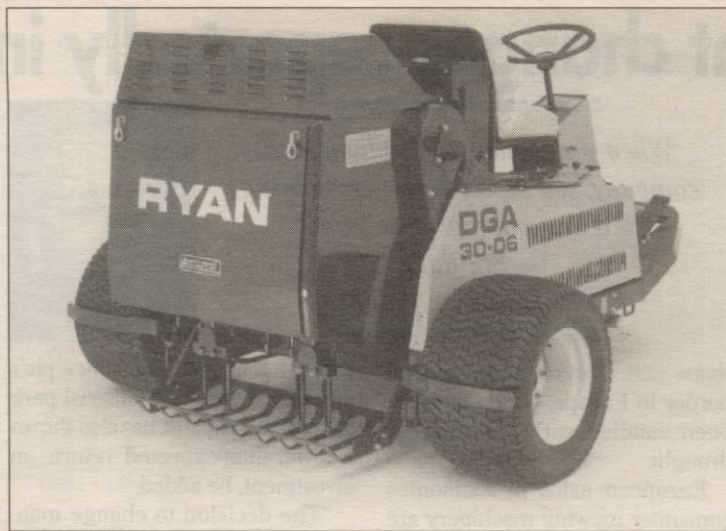
Ryan Deep Greens Aerator 30-06