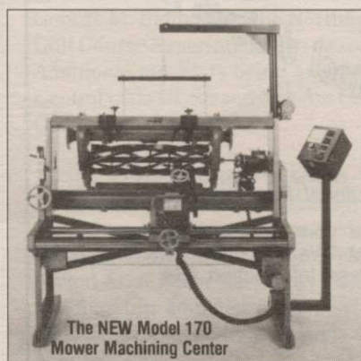
The NEW Model 170 Mower Machining Center

All Neary Models sharpen faster, more accurately than ever, thanks to our continued engineering innovations. Find out which upgradeable Model meets both your performance and your budget needs. Call today for FREE literature or the name of the Neary dealer nearest you. 800-233-4973