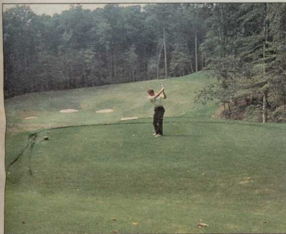
The 195-yard 11th hole at Colonial Williamsburg's Golden Horseshoe Green Course, designed by Rees Jones, features an amphitheater green nestled above a sharp slope to a pond in front. For more on new courses, see pages 23-26.

Superintendents association survey to answer pesticide and fertilizer use questions for scientists .....18