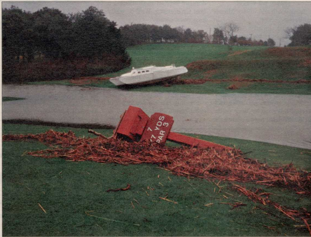
A catamaran takes up residence on a fairway at Eastward Ho Country Club on Massachusetts' Cape Cod.

"The ocean came in with such fury it took out a portion of the 7th tee, went over the tee into the fairway, and flooded the fairway. Boats, docks, anything that wasn't tied down broke loose. We have lumber, chairs, propane tanks, all sorts of things on our shoreline."