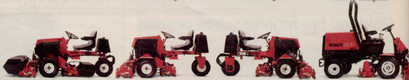
REELMASTER 216 3 wheel drive, gasoline powered 8 blade floating head.