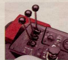
The 335 offers independent reel control levers and variable reel speed control knob.