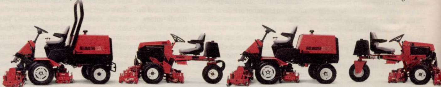
REELMASTER 335-D 4 wheel drive, diesel powered 5 blade fixed head.