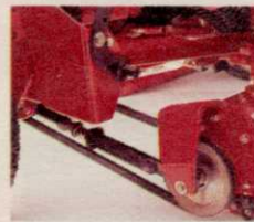
The 216 offers a unique reel drive system that maintains constant belt tension.