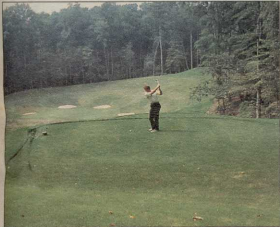
The 195-yard 11th hole at Colonial Williamsburg's Golden Horseshoe Green Course, designed by Rees Jones, features an amphitheater green nestled above a sharp slope to a pond in front. For more on new courses, see pages 23-26.

Superintendents association survey to answer pesticide and fertilizer use questions for scientists .....18