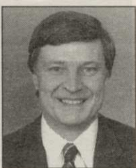
Rep. Jimmy Hayes

Noting that 60 to 70 percent of the American population lives within 50 miles of the coast, he added: "We have people living there,