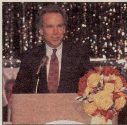
Roger Staubach speaks at the CMAA Conference.

The normally quiet Mike Ditka was the first to speak during a team meeting following the seventh game. In no uncertain terms, Ditka told his fellow players they had all been playing as individuals, not as a team. That