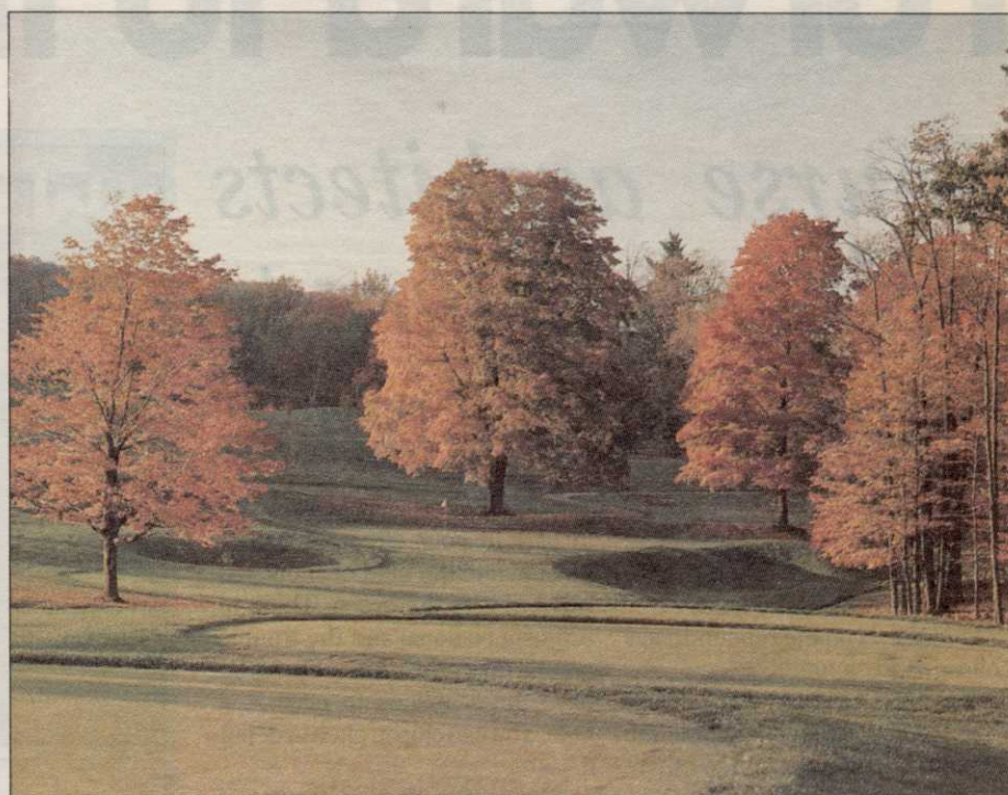
The 6th hole shows just some of the fall beauty at Greystone Golf Club in Toronto.

Because of the slope from the tee to the