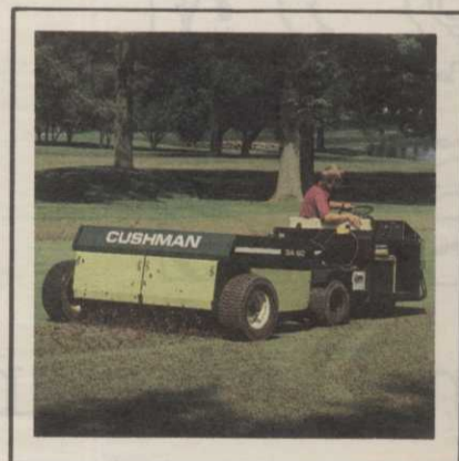
Coming Soon. Cushman GA60 Large Area Aerator The first in a new generation of 5th wheel accessories.