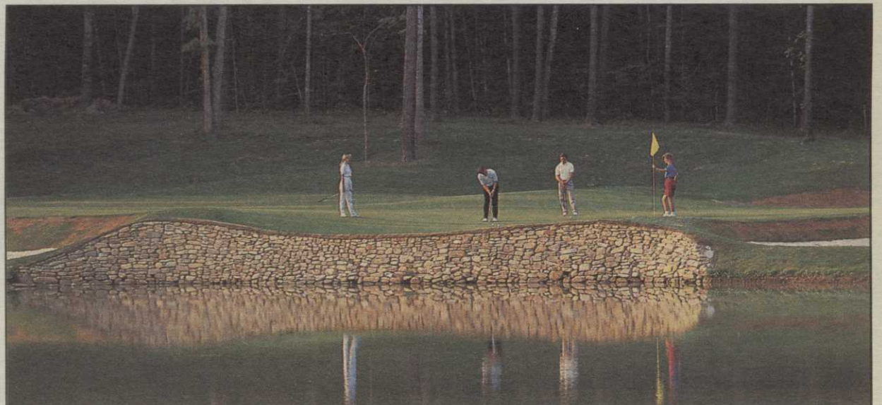
Water comes into play on several holes, including this one, at Jack Nicklaus' latest design — the private Governors Club in Chapel Hill, N.C. Nicklaus and club pro Ronnie Parker played the inaugural round at Governors Club on Sept. 5. The par 72