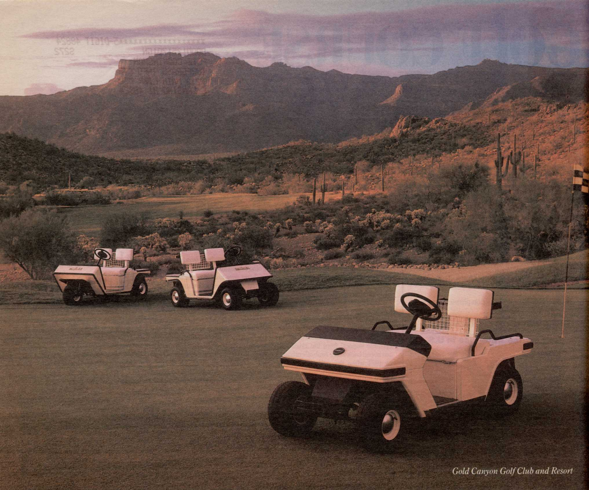
Gold Canyon Golf Club and Resort