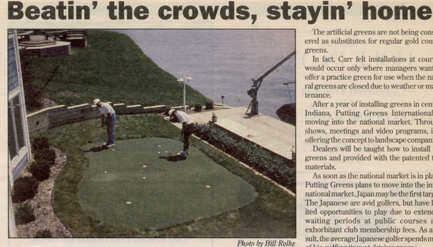
Putting greens can be sized, shaped and undulated to the customer's desires

AS WELL AS • TENNIS COURTS • BOCCIE COURTS AND OTHER NATURAL SPORT SURFACES