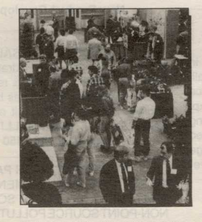
"helping your business grow". Bring your tough questions and talk oneto-one with the people who can guide you in making informed decisions.

A RECORD NUMBER OF EXHIBITORS! 385 of America's leading companies, from every facet of horticulture, will be exhibiting at the Mid-America Horticultural Trade Show in Chicago, January 17-19, 1991. Displaying over 65,000 sq. ft. of all that's new and exciting in green goods, equipment, supplies, and services . . . from companies that are known for