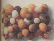
Prills Shown Actual Size

Introducing ONCE™— A line of controlled re- lease turf and landscape fertilizers that require only one application per season.