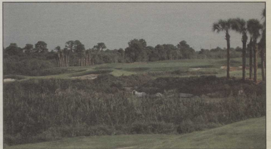
The picturesque 4th hole at The Bayou Club will become the 16th hole in the new layout. See page 11 for more details and news on other courses.

BY PETER BLAIS The Tampa businessman who purchased Bardmoor Country Club in Largo, Fla., March 30 plans to open one of the courses to the public and finish the last nine holes of a private, Tom Fazio-designed layout.