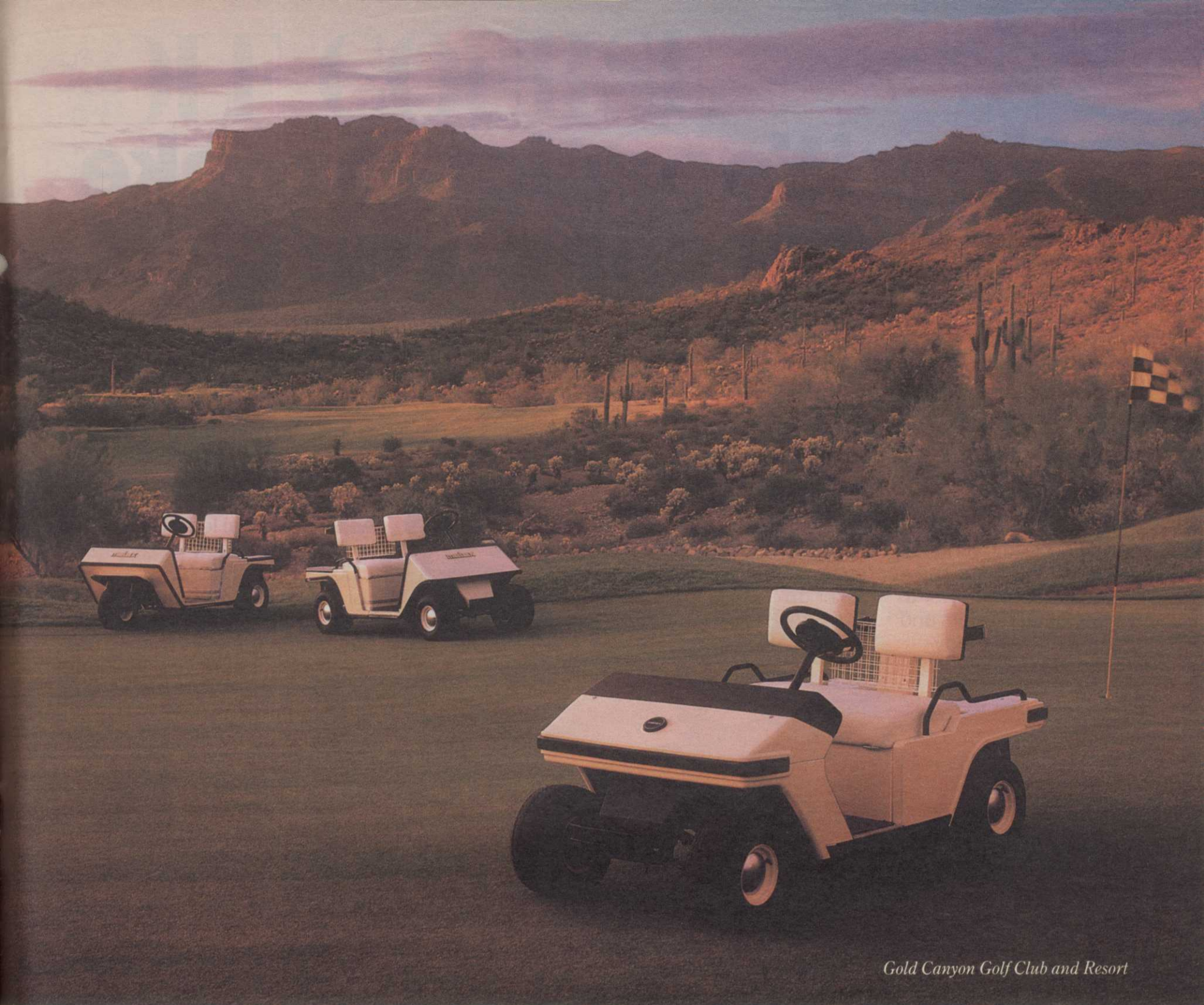
Gold Canyon Golf Club and Resort