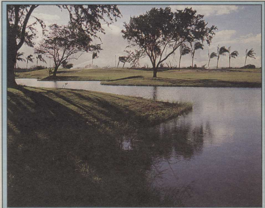
Officials hope West Loch Golf Course has sextupled in value before evening opening.