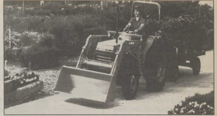
Kubota L3650 Tractor

With no clutching or pedal operation and a strong main hydraulic system, the L3650GST is practical for front-loader work. Other implements available include a rotary tiller, backhoe, rotary cutter, post hole