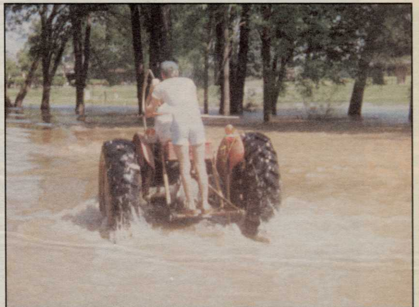
A tractor bulls through flood waters at Rebsamen Park Municipal Golf Course in Little Rock, Ark.