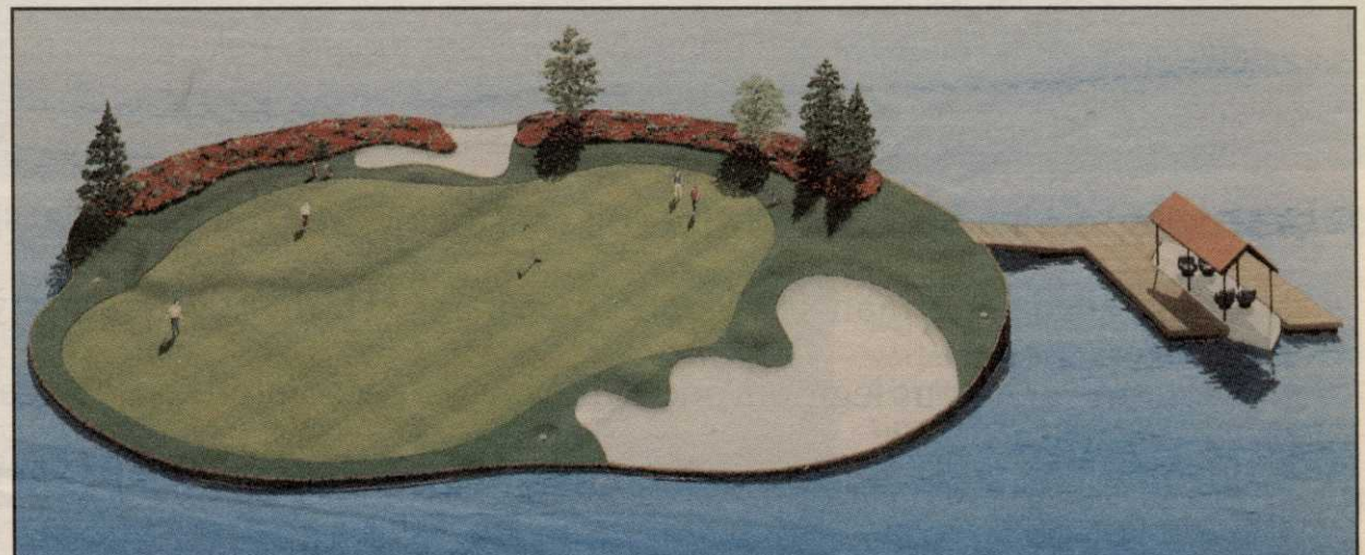
The floating 4th green at Coeur d'Alene is a monument to engineering and innovation.