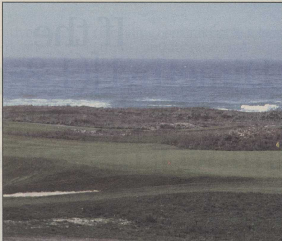
The Links at Spanish Bay in Monterey, CA seeded with Jamestown chewings fescue

No Navy or Marine facilities with golf courses were recommended for closing by the Commission on Base Realignment and Closure.