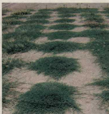
Note the uniformity of Putter plants in the center row as compared with the wide variants within competing varieties on either side of Putter.

The rich, dark, bluish-green color is irresistible to every golfer. With excellent turf vigor, fine-leaf texture and improved resistance to take-all patch disease, Putter is exciting news for golf course maintenance staffs. Quality features include a dwarf growth habit and high-shoot density. It's highly aggressive against Poa annua .